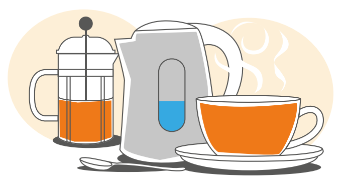
Ginger Energy - focusing all our energy on helping you to save yours | www.gingerenergy.co.uk